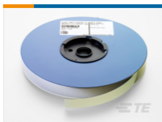
TE Part # 890103-000 S1124-TAPE-0.75X100-FT